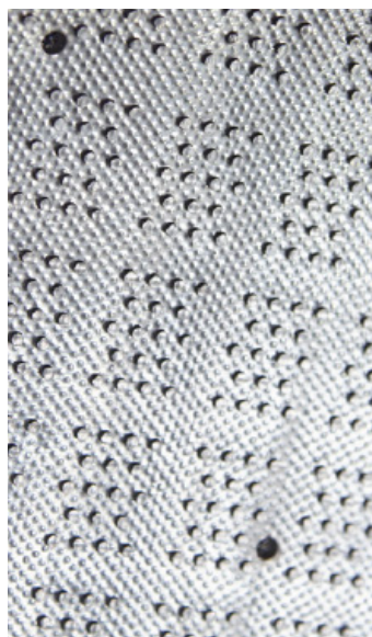
Gripper backing with drainage holes