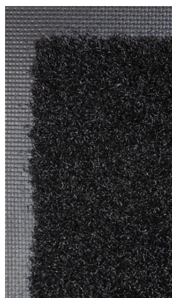
Reinforced rubber edges